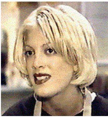
Tori Spelling - Our Hero